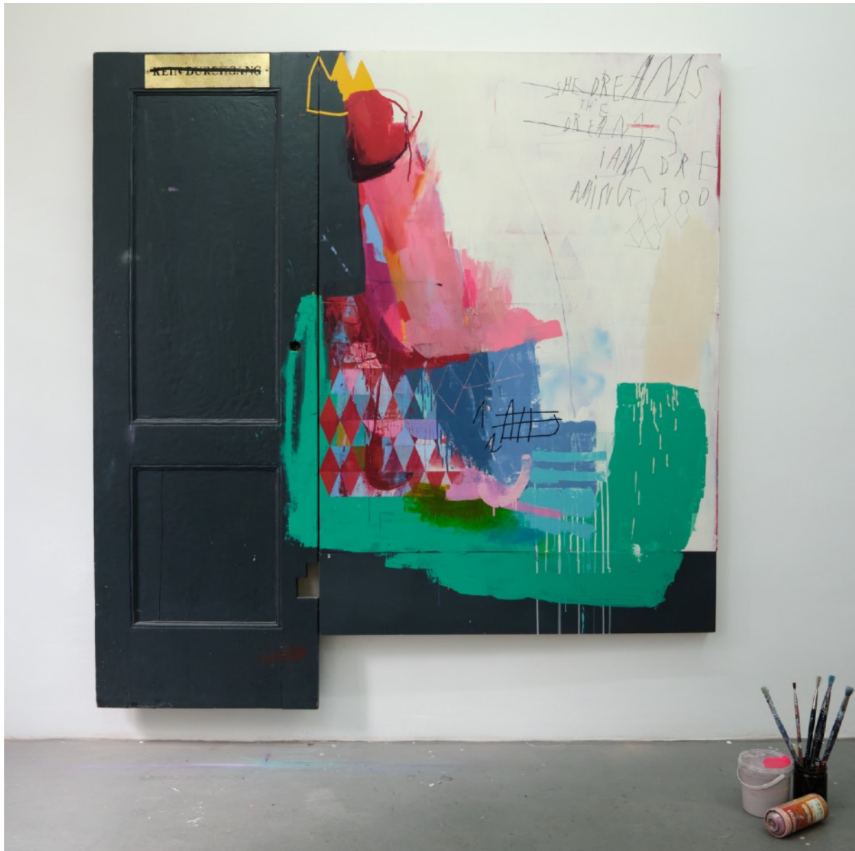
DANNY GRETSCHER „She dreams the dreams I’m dreaming too“ Mixed media on wood, 190 x 180 cm, 2018