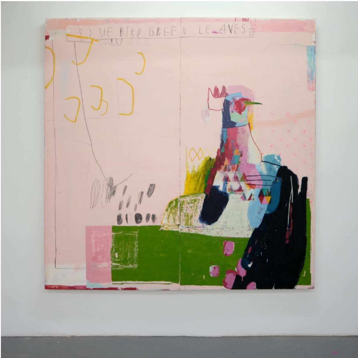
DANNY GRETSCHER „Blue bird green leaves“ Mixed media on wood, 170 x 170 cm, 2019