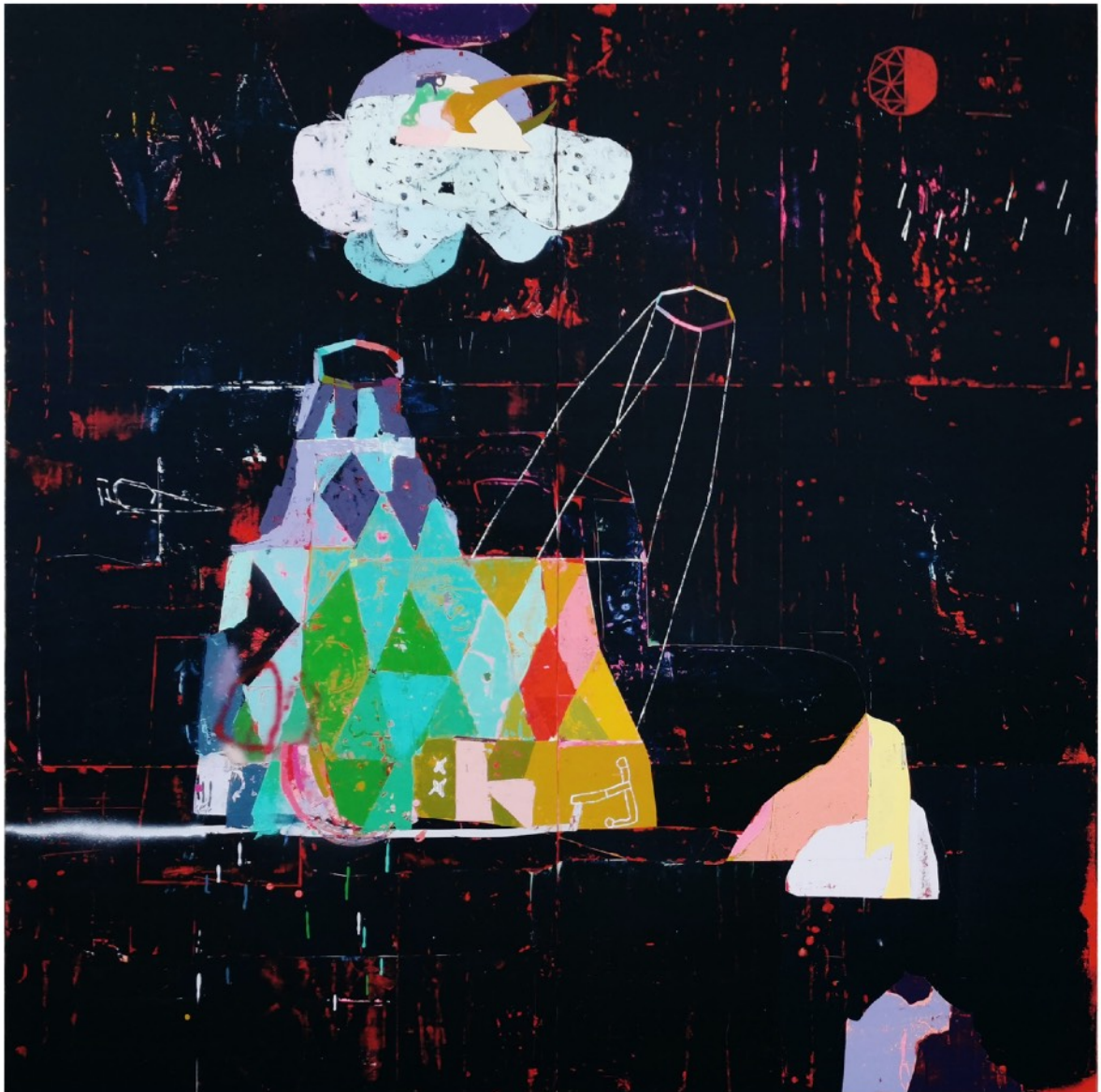
DANNY GRETSCHER „The Spirit Is Near - Blooming in Solitude“ 170x170cm, 2021