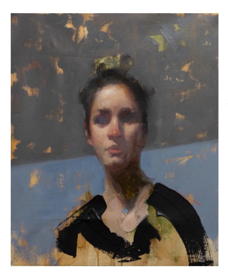
"With Relevance" John Wentz Oil on canvas. 2020 50x60 cm framed in black shadow gap

"To Break Bread" John Wentz Oil on canvas. 2020 50x60 cm framed in black shadow gap